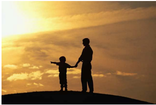
Our Father who art in heaven, hallowed be Thy name. [Matthew 6:9]

How well do you know your heavenly Father? The Father of creation, the one who formed man from the dust of the earth, and breathed into his nostrils the breath of life? Many today know Him as “God” or “the Lord,” but is knowing Him in this manner truly knowing Him?