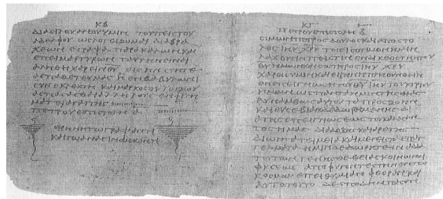
A papyrus copy of Peter’s epistles, P 72 , from about A.D. 200.

At this time I would like to point out that in the Greek texts of the New Testament there are no punctuation marks, and the words run directly together one after another. Not only is this the case, but in many texts, only capitalized letters are used. The following fragment from an early epistle of Peter illustrates this beautifully.